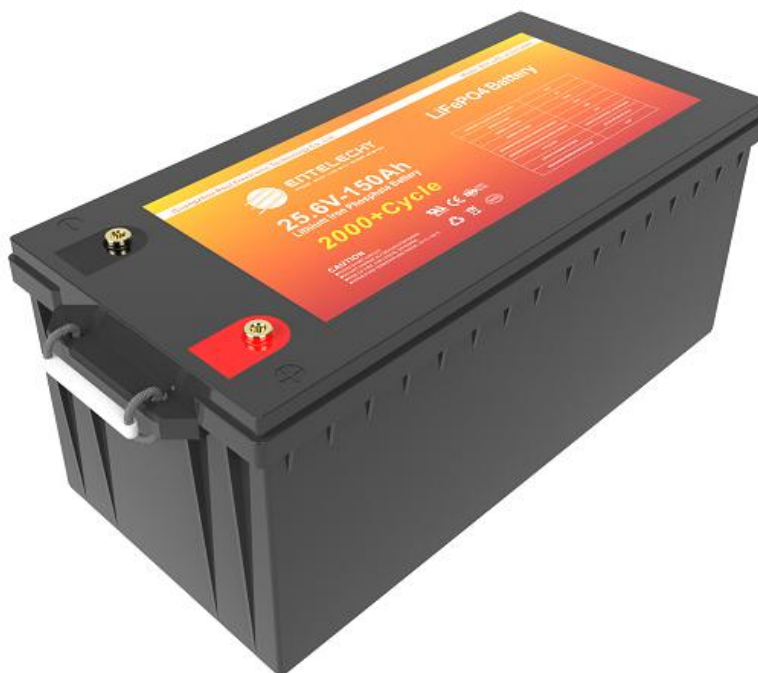
25.6V100Ah Battery outside picture

(Picture only for you reference, result depends on production)